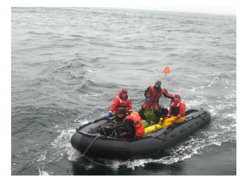
Figure 1. The happy zodiac team after a successful glider recovery.

During this week, the team completed the full line sampling grid occupying three stations for the 600, 500, 400, 300, 200, 100, 000, -100 lines. This is the first time in a decade when ice did not keep of us from completing the full grid. Generally, the grid showed increased primary